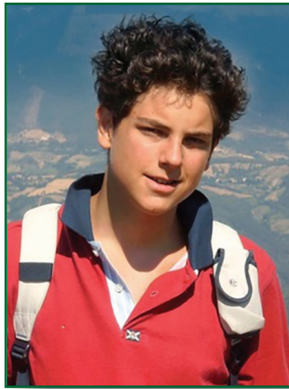
Blessed Carlo Acutis

Christopher Columbus, Father Saint Junipero Serra, George Washington, Thomas Jefferson, Frederick Douglass,