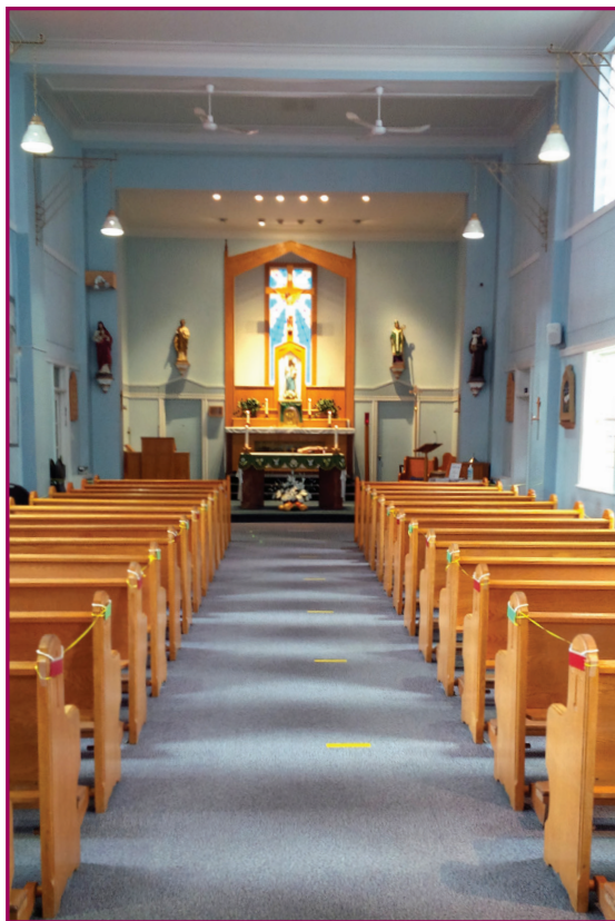
Inside the Church.

also from Catholic Immigration, into their houses so they can adjust socially and culturally into Canadian society. The refugees are helped to gain employment, and they are ready to leave after three months or so. Our parishioners will be able to help in various ways with this ministry through volunteer opportunities.