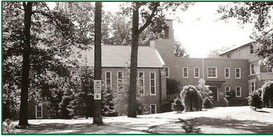
Holy Family Seminary