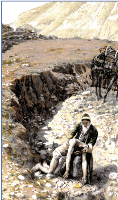
The Good Samaritan

the priest and Levite, the Good Samaritan took care of the person who was robbed and beaten. (Luke 10:25-37)