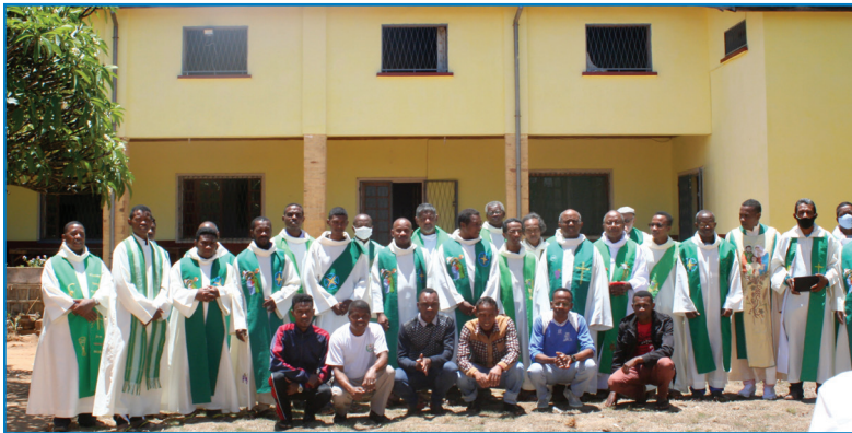
Some priests and seminarians of the Madagascar Province of the Missionaries of the Holy Family gather together after Mass in November 2020.