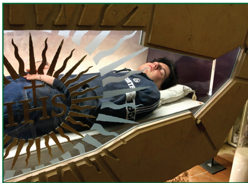
Body in Repose