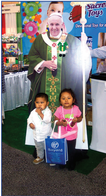
World Meeting of Families

equality of everyone living on this planet, which is the opposite of individualism and selfishness. Radical individualism is a virus that can create many hardships and injustices in our relationships with other people.