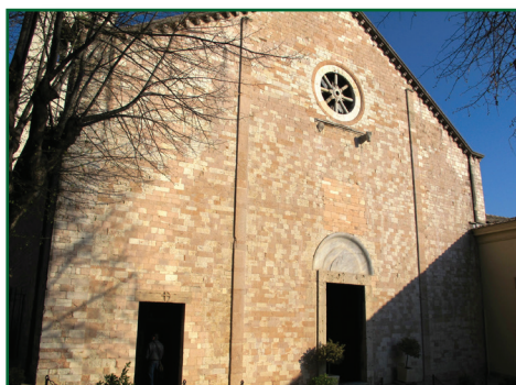
Church of Burial

Why not, like our new lodestar pilot Blessed Carlo Acutis, aim for the infinite and steer beyond the stars, the heavens – toward Heaven? +JM+