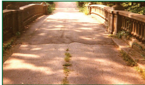
Bridge road to seminary.

Where do I begin to tell the story of an experience so long ago? My life in the seminary begins with a truck ride. My