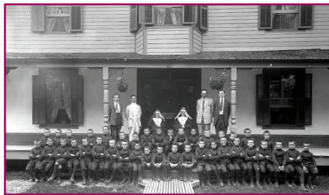
The Treasures of God from the 1890s.

Queen of the Most Holy Rosary here in Ottawa on Wellington Street where it became a lodge before it actually became a parish in 1947. The building has been used in various ways and for various causes.